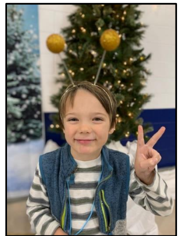
More pictures can be found on the school Facebook page.