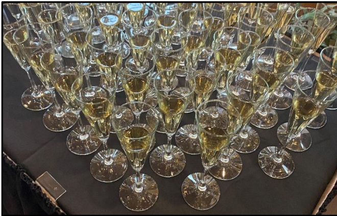
Anonymous through the NSFCU Patronage Reward Program $500 Sponsorship