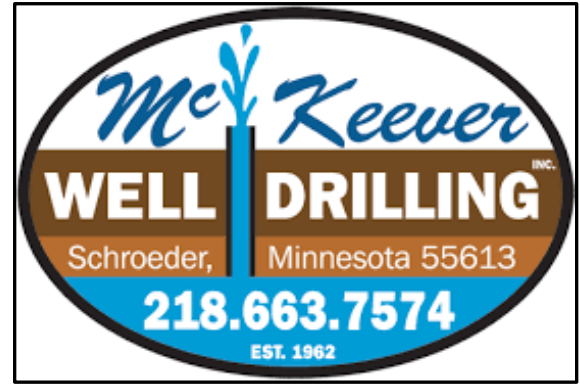
McKeever Well Drilling $500 Sponsorship